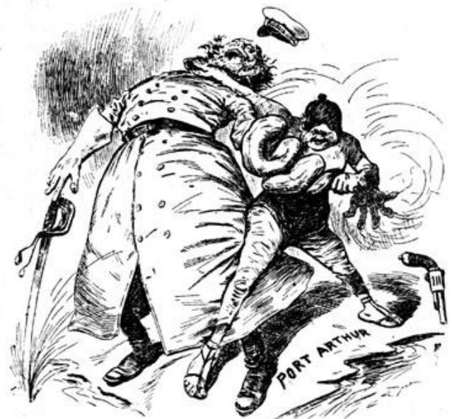
GIVING HIM THE JIU-JITSU.—From the World (New York). (The jiu-jitsu is the coup de grace of the Japanese wrestlers.)