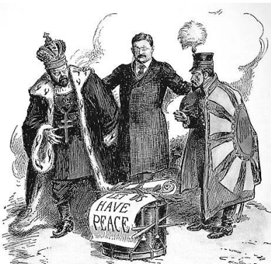
"Let's have peace"