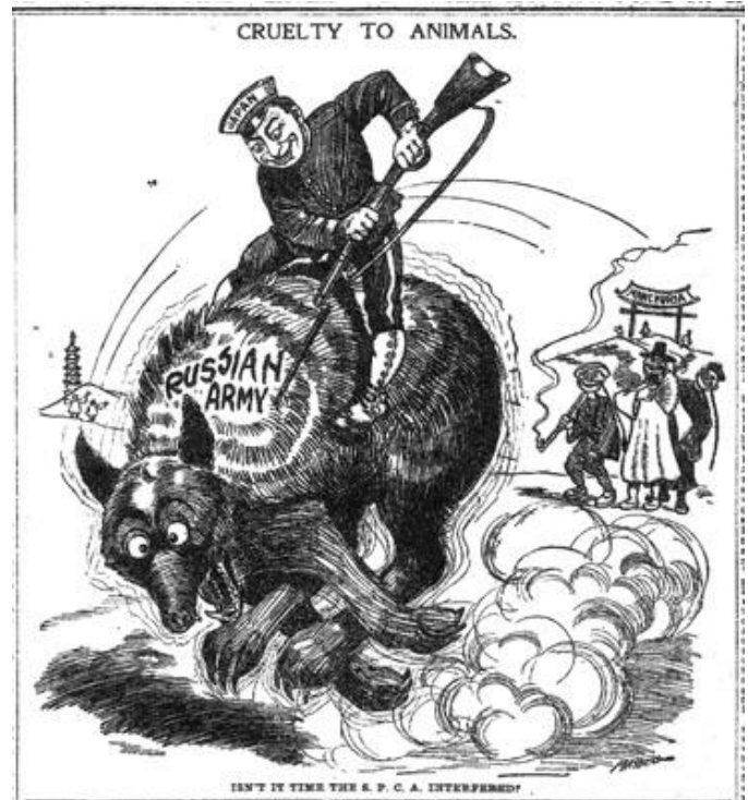
"Isn't it time the A.S.P.C.A. interfered?"